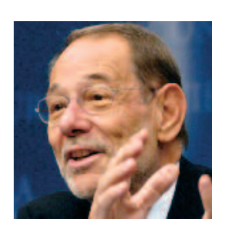
JAVIER SOLANA High Representative for the Common Foreign and Security Policy, SecretaryGeneral of the Council of the European Union