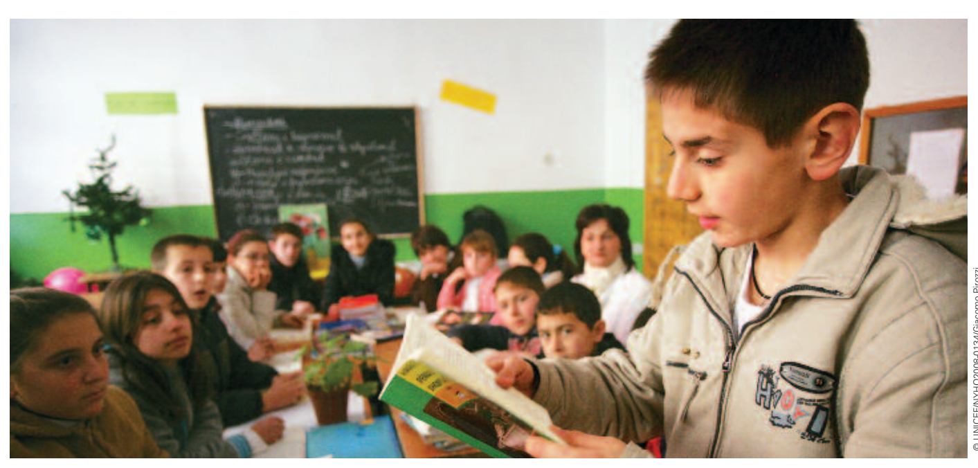
Providing quality education is central to enabling children to reach their full potential. A 13-year-old boy reads aloud as his teacher and classmates listen, in Ahmet Gashi Compulsory School in Tirana, Albania.

tant decisions applying the treaty's provisions. Furthermore, since 1989, one third of the countries studied had also integrated the Convention into their national constitutions. Almost all of these countries had made strong efforts to bring their legislation into conformity with the Convention by adopting child rights codes or through the gradual, systematic reform of existing law, or both.