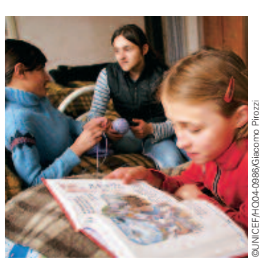
12- and 15-year-old girls talk and read in their bedroom at the 'Sparrows' shelter for children living and working on the streets in Tbilisi, Georgia.

Even the smallest effort can bring about the greatest victory – saving the life of one of these beautiful children. They want nothing more than to actually be children, with all of the fun, freedom and security that childhood should entail – and that countries acknowledge in the Convention on the Rights of the Child.