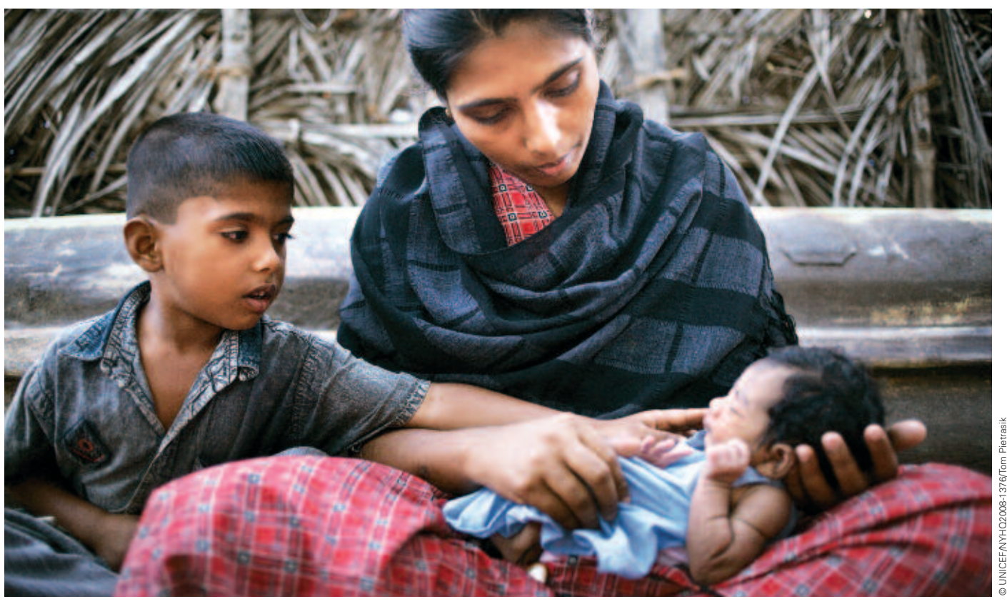
Supporting social and cultural values that promote the rights of children is central to protecting them from violence, abuse, exploitation, discrimination and neglect. A boy plays with his baby sister in Aragam Bay Village in the eastern Ampara District, Sri Lanka.