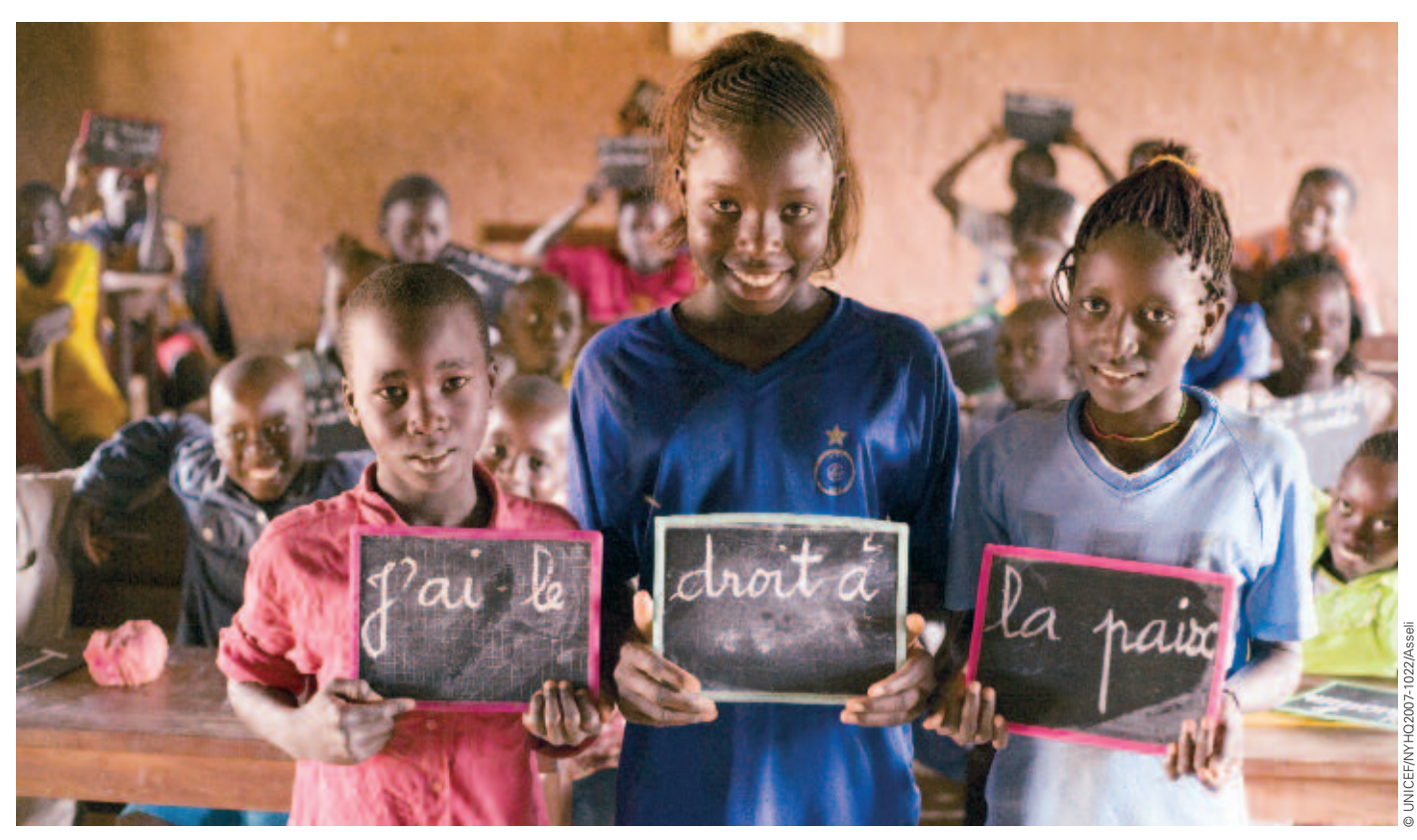
Realizing child rights is pivotal to creating the world envisioned by the Millennium Declaration — one of peace, equity, tolerance, security, freedom, solidarity, respect for the environment and shared responsibility. "I have a right to peace," read the slates of these children standing at the front of their classroom in Kabiline I Primary School in the village of Kabiline, Senegal.

General Comment provides guidance to Member States and other stakeholders to enhance their understanding and interpretation of the article; elaborates the scope of the legislation, policy and practice needed to achieve its full implementation; highlights positive approaches in its implementation; and proposes basic requirements for appropriate ways to give due weight to children's views in all matters that affect them.