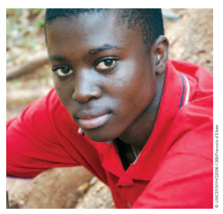
To make the vision of the Convention a reality for every child, it must become a guiding document for every human being. An 18-year-old boy advocates against the sexual exploitation and abuse of children, and participates in several child rights groups in his community in Lusaka, Zambia.

In this sense the need for a change in values links back to the history of the Convention and the campaigns for child rights that preceded it. Those campaigners who were outraged by the treatment of children in 19th-century factories or by their