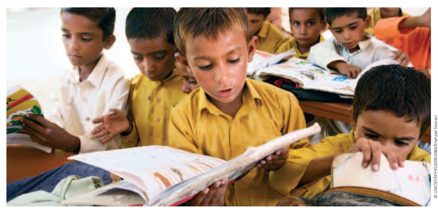
Developing the capacities of governments, communities, families and children is critical to the greater understanding and promotion of children's rights. Boys study using their exercise books at Basti Arian Government Boys Primary School in the village of Basti Arian in Rahim Yar Khan District, Punjab Province, Pakistan.