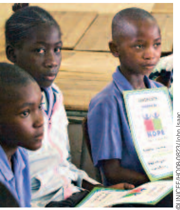
Grade 4 students hold 'Window of Hope' certificates at the end of a life-skills education session at Ehenya Primary School in the northern Oshana Region, Namibia.

The work to fulfil child rights is not an easy task. But it is one that cannot be ignored. The Convention on the Rights of the Child demands that families, communities and governments acknowledge and meet their fundamental responsibilities to care for and protect the world's 2.2 billion children. While I believe the international community has come a long way in the implementation of the Convention, stronger child, youth and community participation is required to sustain success. Ultimately, children will determine the moral and ethical future of nations, and the world. Their voices must be heard.