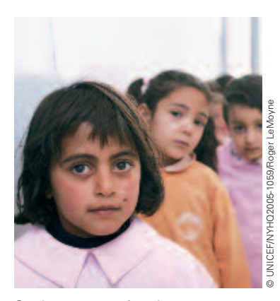
Students queue for class at Timnin El-Tahta, a public school in the north-east Beqaa Valley region, Lebanon.

As the Convention on the Rights of the Child celebrates its 20th anniversary, the private sector has every reason to be grateful for the emphasis it brings to the power of developing a new generation of citizens, and the reminder that children are the flowers of our societies. We take great joy in having been provoked by the Convention's ideas, and in looking forward to what we can do to promote them in the future.