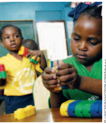
A girl plays with colourful plastic blocks at Denham Town Basic School in the parish of Kingston and St. Andrew, Jamaica.

None of these measures would have been possible without the combination of two fundamental factors: the will of the President to give child protection policies the priority they deserve, and a serious macroeconomic policy that assures the resources needed for its implementation – regardless of the external shocks that are affecting the economy. An important benefit of the fiscal surplus rule applied in Chile is that expenditure is not linked to the transitory components of income, which, in the context of the current crisis, allows for the use of the resources saved by our country during the boom years. This has enabled us to ensure the continuity of the social protection system that is the seal of the Government of President Bachelet and that is at the heart of the Convention on the Rights of the Child.