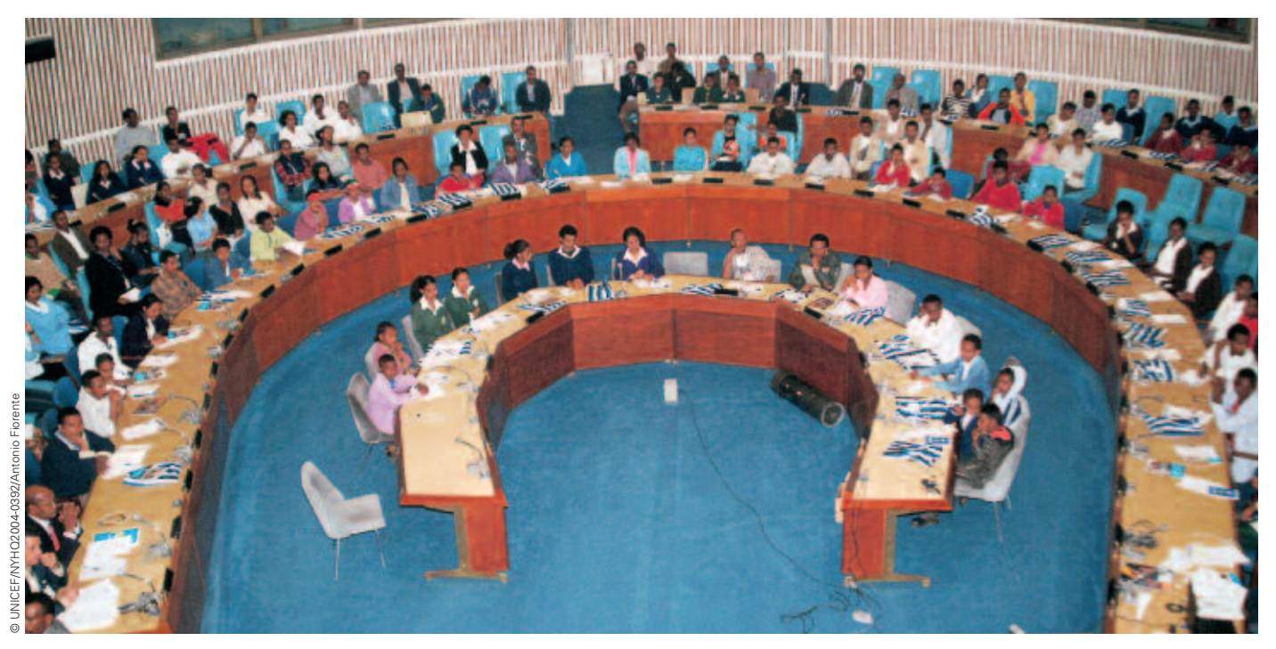
Innovative, integrated and collaborative approaches, including children as key partners, are required to fulfil the objectives of the Convention and other international compacts on child rights. Children aged 9–18 participate in the Fifth Ethiopian Teenagers' Forum at the United Nations Economic Commission for Africa in Addis Ababa, Ethiopia.

aspects of the Convention for the very first time. With sound leadership, collaboration, advocacy and creativity, the uncertain outlook for the world's economy and environment can also become an opportunity for governments and other stakeholders to renew their commitment to the principles and articles of the Convention, work together to consolidate the gains in child rights and development outcomes achieved over the past two decades, and forge a supportive environment that will advance and safeguard child rights come what may.