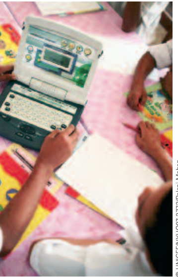
Children collaborate on a project using a minicomputer at Timbang Island Primary School, on Timbang Island in the state of Sabah, Malaysia.

In Malaysia, education is no longer a distant dream, but a promise we have made to every child. Drawing on the Convention on the Rights of the Child, we will press on in our efforts to care for the most vulnerable and isolated of children. Our hope is to build a better future for the children of our country and, in turn, to see them build a better future for our world.