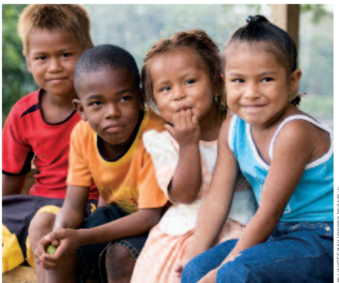
Building national child protection systems that seek to establish a protective environment for children reduces their vulnerability to violence, abuse and exploitation. Indigenous and Afro-descendant children sit on a low wall in the rural eastern town of Yaviza in Darién Province, Panama.

Promote open discussion of child protection issues. Silence is a major impediment to securing government com-