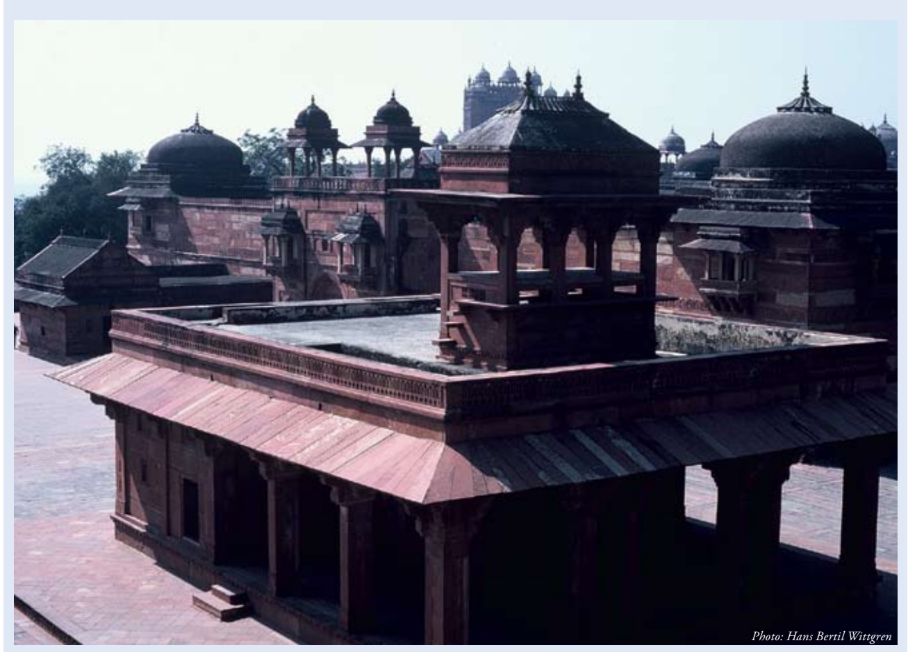
Fatehpur Sikri, near Agra in Uttar Pradesh, India, was constructed by the Mughal emperor Akbar and served as the empire's capital from 1571 until 1585, when it was abandoned due to water scarcity.

The stream of people moving to large urban centres with hope of better fortune increases each year and this trend has led to large numbers of people, especially the poor, settling and living in floodplains in and around urban areas. <sup>13</sup> Many of these areas lie outside of the formal city limits (peri-urban areas) so they are unplanned and unregulated. They are ignored in urban planning systems so they continually lack adequate drainage systems, water supply and sanitation facilities. They are ticking time-bombs waiting for excessive storms to hit.