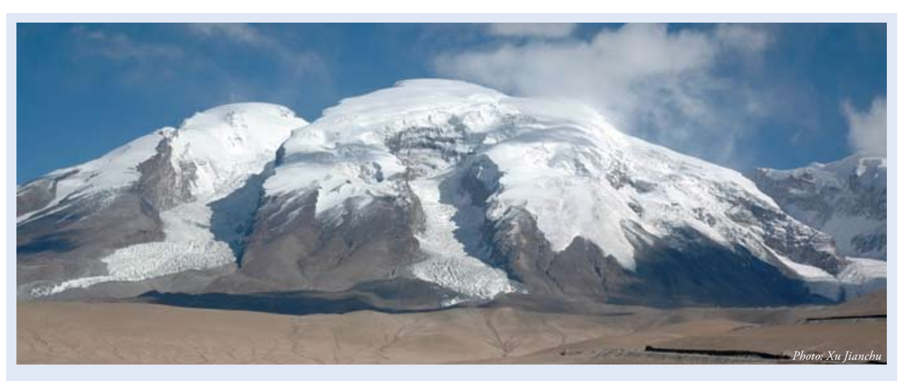
Box 1: Melting glaciers in the Himalayas <sup>16</sup>

In general terms, the projected impacts of climate change on water resources are a continuation of the impacts that have already been observed. At the same time, there are uncertainties of various magnitudes associated with the projections. The findings of several global models should be examined to reduce this uncertainty, especially in regard to regional or local effects. A very robust finding appears to be that warming will lead to changes in the seasonality of river flows in areas where much of winter precipitation currently falls as snow. On the other hand, the projections of future rates of sea level rise currently carry large uncertainties.