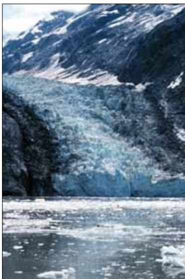
Johns Hopkins Glacier.

There is less certainty in other projections, such as how the combination of greenhouse gas increases, temperature increases, precipitation changes, and other climate and climate-related changes will affect agricultural crops and natural ecosystems in different regions. Furthermore, different sectors, populations, and regions will vary in their exposure and sensitivity to the impacts of these changes; in general, research suggests that the impacts of climate change will more harshly affect poorer nations and communities.