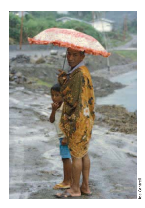
The Asia Foundation. 2009. Final Report: Access to Justice for the Urban Poor. ADB (RETA 6366). p. 2.

Access to Justice for the Urban Poor aims to "understand the role that dispute resolution processes have or may have in mitigating disputes over urban assets and improving access to assets for the urban poor." Grievance and dispute resolution mechanisms have been viewed as a means of enabling citizens to demand greater accountability from the public sector and service providers, thereby improving overall urban governance.