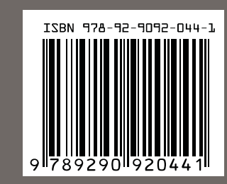
Printed in the Philippines

Based in Manila, ADB is owned by 67 members, including 48 from the region. Its main instruments for helping its developing member countries are policy dialogue, loans, equity investments, guarantees, grants, and technical assistance.