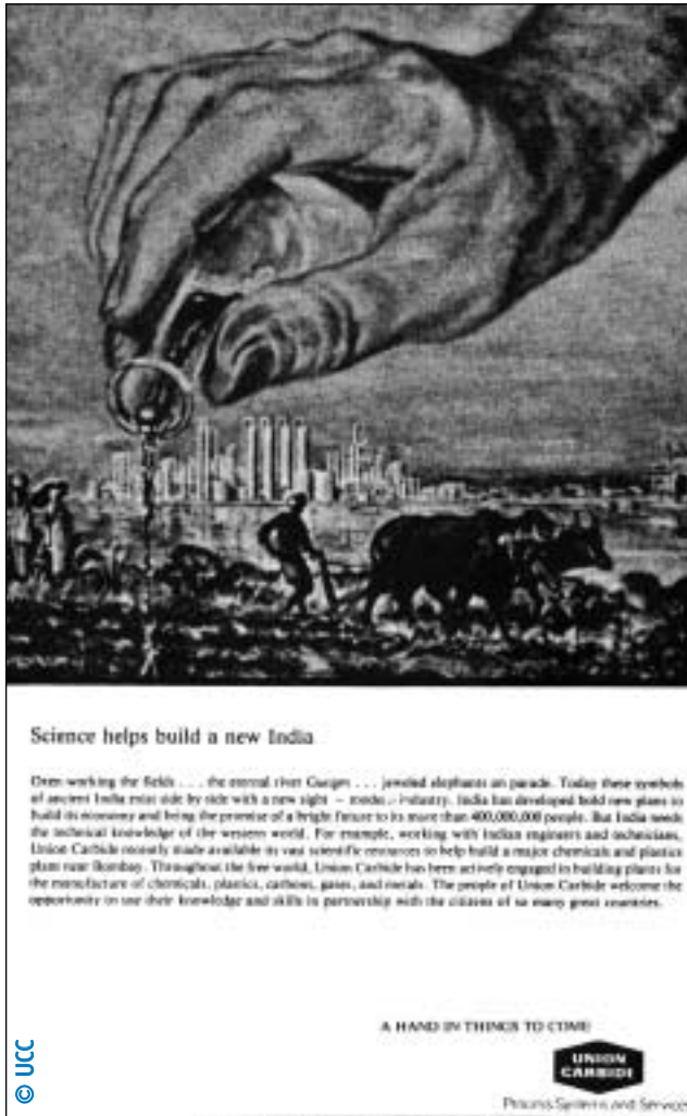
A 1962 advertisement announcing the arrival of Union Carbide in India.

to actual liability at this stage of the litigation.” 171