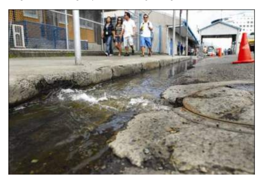
Plate 2: Overflowing Sewage in front of Fiji Ports Corporation Limited head office at the Kings Wharf in Suva.

The inadequacy of centralised wastewater collection and treatment infrastructure and system poses its own share of concerns. The frequency of burst sewer mains due to inadequate maintenance and care is causing water pollution, fish deaths through eutrophication and is also a public health issue. The treatment plants also release untreated effluents to the foreshore areas during heavy rainfall events due to inadequate treatment capacity and overloading of the plants.