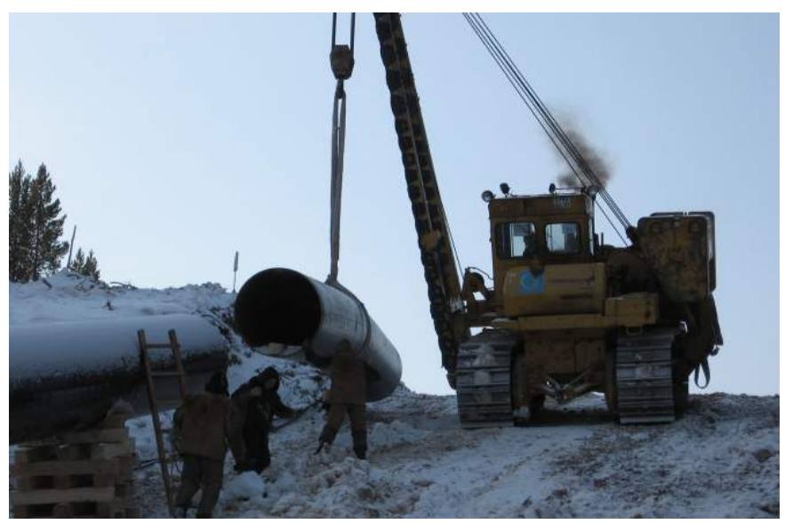
Pipeline construction on the Northern Amurskaya Oblast (Tynda District)