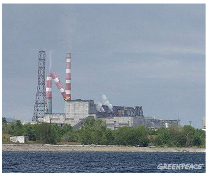
Collage of Baikalski pulp-paper mill