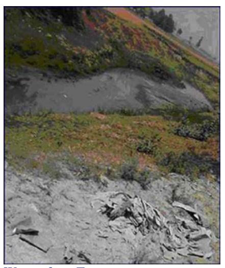
Wastes from Tannery