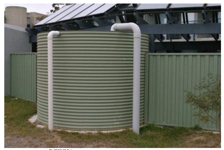
Water recycling