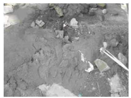
Sludge from Auto Workshop

Under the project, the preparation of the draft policy for Hazardous Waste Management has begun and guidelines will also be prepared.