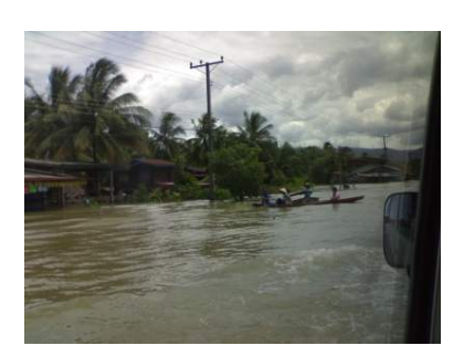
Aug. 08 Pakgnum Village, 14 Aug. 08