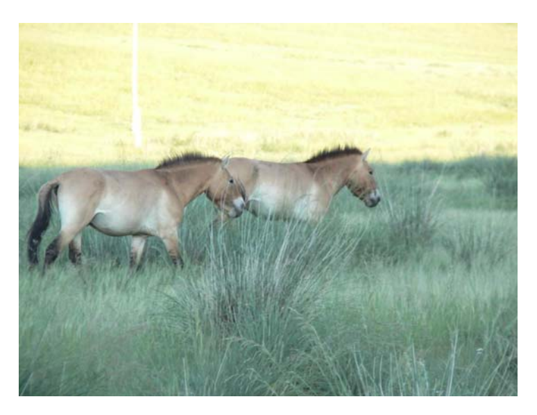
Mongolian Takhi

Ten years later, the Takhi population had increased to 150; today, that number is nearly 200. Horses have long been symbols of strength and courage in Mongolia, and the return of the Takhi has been a source of national pride. With its abundant wildlife, 450 species of flora and dramatic steppe landscapes, Hustai National Park attracts eco-tourists, volunteers, and researchers from all over the world. The Takhi project has also afforded biologists unprecedented opportunities to study the Takhi in the wild.