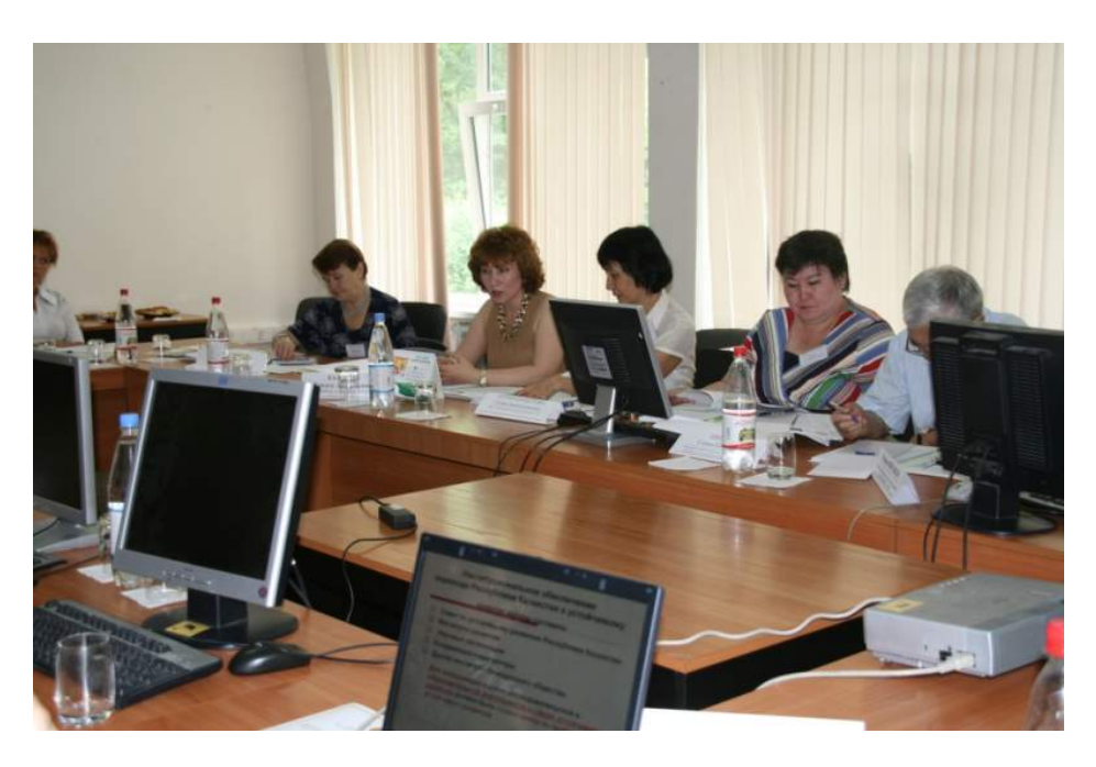
«National workshop "Initial experience and prospects for development of the new subject "Environment and Sustainable Development" August, 2008, Almaty, Kazakhstan.