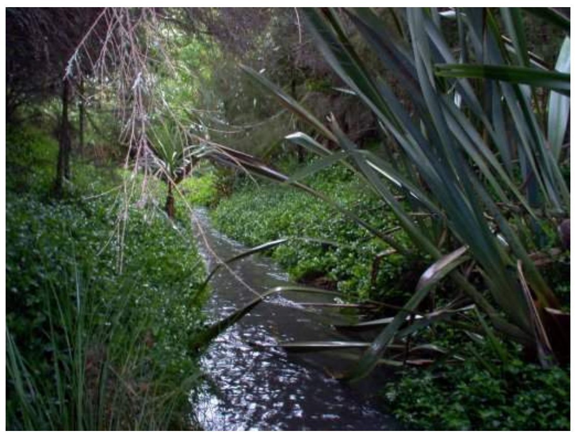
Tradescantia ground cover

A recent study assessed these combined effects on the distribution of the trailing, perennial monocotyledon, Tradescantia fluminensis (Vell.). In New Zealand Tradescantia effectively invades disturbed edges of bush and riparian remnants.