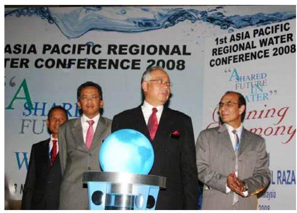
DPM Officiating the 2008 Asia Pacific Regional Water Conference (APRWC)

Held from 18 to 19 November, the event was officiated by the Deputy Prime Minister, the Right Honourable Dato' Sri Mohd Najib Tun Abdul Razak, and pooled public, private and NGO stakeholders from Malaysia, Denmark, the UN, Singapore, Germany, Philippines, India, USA and Indonesia to deliberate on paradigm shifts in managing water, impact of climate change on water resources, legislation as key to efficient water resource management, challenges and options in wastewater treatment, leading-edge technologies for sustainable water provision, novel ways of financing water projects, and the outlook for 2009 and beyond. Among the conference highlights deemed as pointers to future direction of the water industry were adaptation and mitigation measures, investment in hard and soft solutions and, to overcome the currently fragmented institutional framework, a proposal to establish and endorse a National Water Policy.