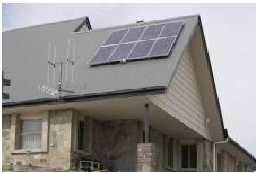
Solar panels