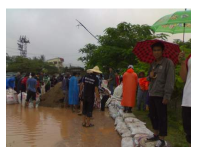
Kauliewe Village, 12 Aug. 08

Dong Dok Vientane meteorological station recognised that, despite it usually being the start of the dry season, November 2008 had almost no rainfall, but there was still heavy monsoon rain with rainfall levels reaching 91.8 mm over 4 days from October 30 to November 3.