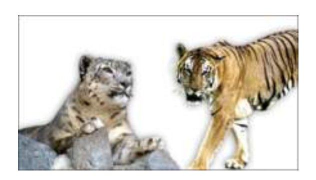
The snow leopard and the Royal Bengal tiger

Previous data shows that there are between 115 and 150 tigers in Bhutan