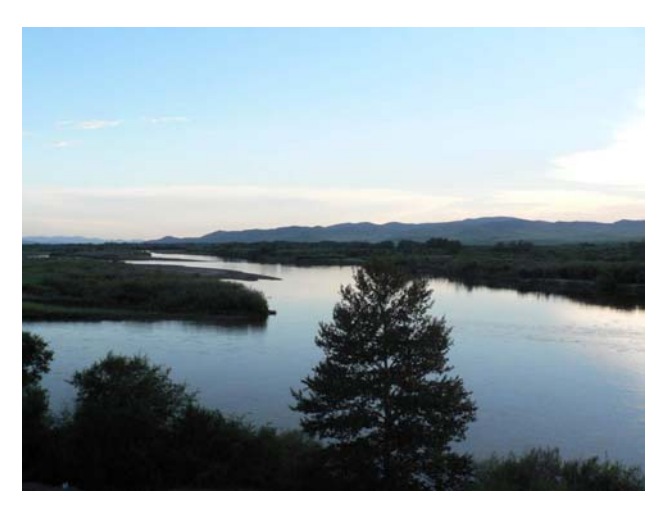
View of Selenge River in Transboundary Area

Academy of Sciences, UNEP-ETB and UNEP/NISD.