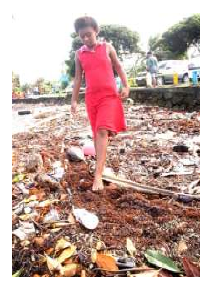
Plate 1: Extent of litter in the Suva foreshore area (The Fiji Times – 4 June 2008)