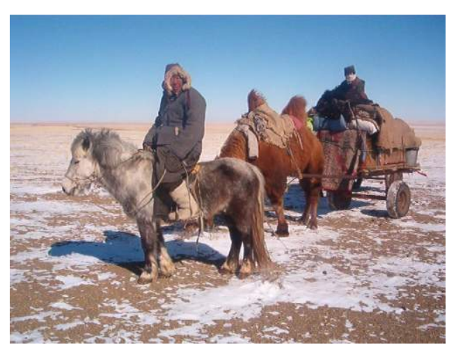
Moving herder