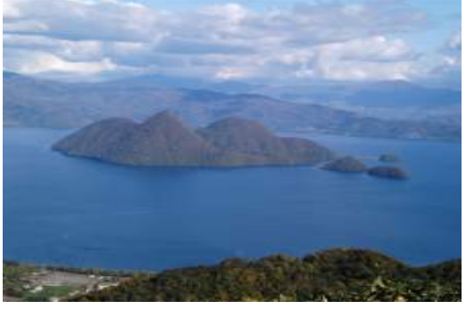
Toyako, Hokkaido, Japan

Detailed information on the outcomes of the G8 Hokkaido Toyako Summit is available at: http://www.g8summit.go.jp/eng/index.html