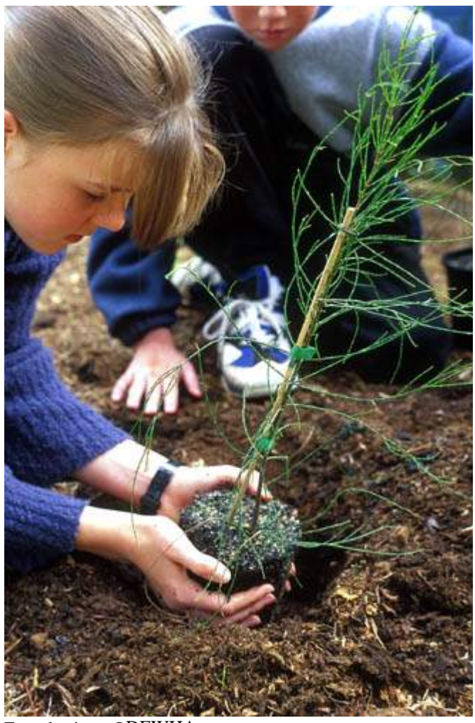
Tree planting