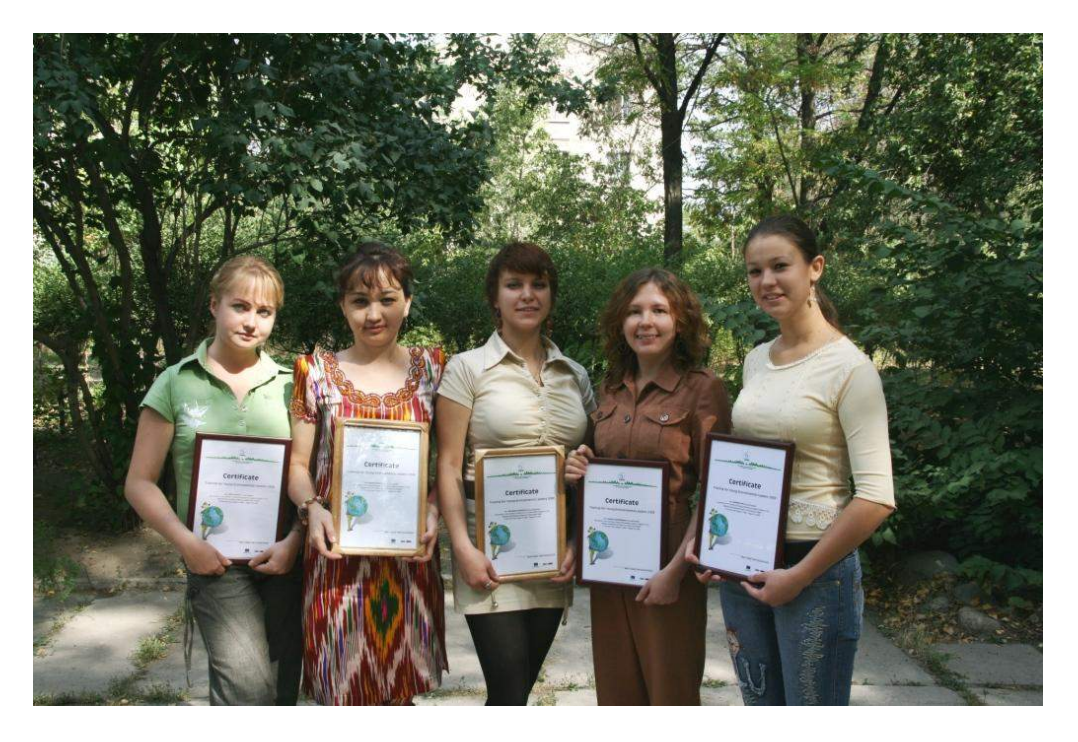
Training for Young Environmental Leaders in Central Asia, Almaty, Kazakhstan.