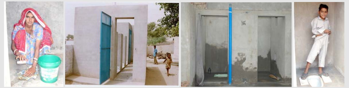
Figure 12: A combined model of simple pour-flush latrine and a separate wash room was jointly developed with the target groups in a KfW supported sanitation project in Rajasthan.

As the KfW Development Bank undertook the project in the 1990s, only 9% of the households had latrines. In the beginning the villagers were sceptic, they feared odour problems and water squander. To foster acceptance, "pilot latrines" were built and with the help of non-governmental organisations water committees were founded. Their tasks include equitable distribution of water, collection of fees and making sure latrines are kept clean. They developed a combined model of simple pour-flush latrine and a separate wash room. Such a facility with permanent walls, roof and doors costs about 135 Euro. They became so popular in the meantime, that only 20% still needs to be subsidised, whereas originally 60% was subsidised. About 30,000 latrines and 95 sanitation facilities for schools have been financed until 2007.