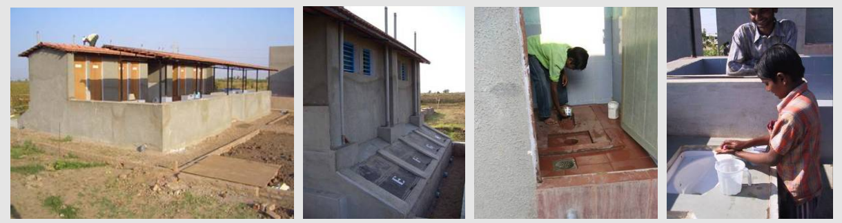
Figure 7: The school's sanitation block (far left), and from the back (left). Faeces are not flushed with water, but sprinkled with dry material, e.g. ash, over them (right). Hygiene education, such as hand washing is part of the scheme (middle).

In one of the GTZ-supported "Navsarjan Trust" schools' pupils have recently received the "Young Scientists" prize in the Ahmedabad school science fair for the model they built by them, which demonstrates the functional principles of their school's urine diversion toilets. After one year of storage in the dry climate of Gujarat, the faeces are converted into harmless, hygienic nutrient-rich material. This material is excellent to improve the fertility of the region's barren soils.