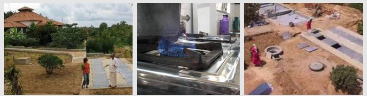
Figure 11: Surroundings of Camphill Trust building do allow reuse of treated water and produced fertiliser (left) Biogas is used for cooking (R) Biogas plant with sludge drying beds (L)

The treatment system consists of 4 parts: Biogas settler, baffled reactor, planted gravel filter and the collection pond. The wastewater streams from the toilets, bathrooms, laundry and kitchen are channelled from different residential blocks and collected in a common place near the treatment system. The grease traps at the source provides pre-treatment to retain oil and grease by floatation. A fixed dome type of Biogas settler is installed that stores the biogas produced (approximately 2 to 4 m<sup>3</sup>/day) due to the digestion of settled organic particles under anaerobic conditions. The baffle reactor ensures anaerobic degradation of suspended and dissolved solids by mixing fresh wastewater with an activated sludge blanket while a planted gravel filter is used as tertiary treatment unit where aerobic and facultative degradation of dissolved organics occur. The collection pond is used to store the treated water.