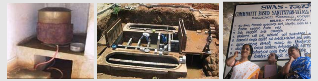
Figure 10: Biogas stoves used for heating of bathing water (left) Construction of the Community based sanitation facility with Biogas settler, baffled reactor, planted gravel filter and the collection tank (middle) Leaders of the WHSG (Women-Self-Help-Group) running the sanitation complex (right)

The "pay-and-use" system meets the demand of the community and is an economically viable incomegenerating activity for the Woman-Self-Help-Group (WSHG) running the facilities. The user fees of an average of 600 people covers the operation and maintenance (O&M) costs of INR 50/cap/month and provides for savings of INR 8.000/month. The transformation of the slum of Ulalu into a peri-urban lowincome settlement has also increased the number of individual toilets, often also shared with the neighbours. Therefore, the number of users from the community has gone down between 2003 and 2008 and use by transit population from the near-by bus station has increased.