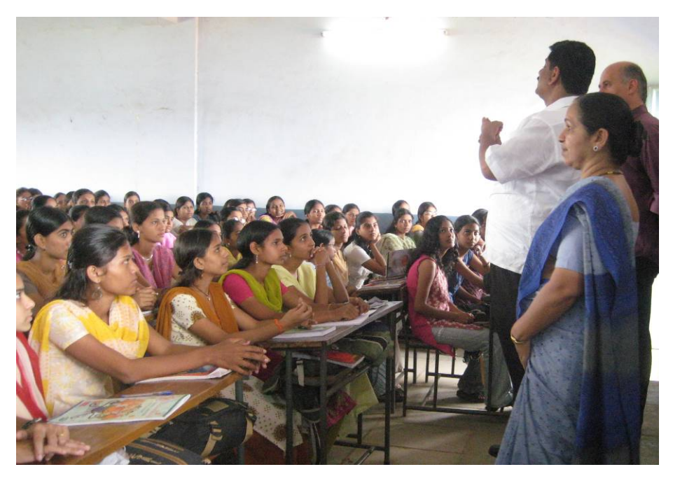
Figure 3: The topic "sustainable sanitation" needs to be included into the curricula of schools, colleges and universities. These students of the Adarsh Vidya Mandir College at Badlapur near Mumbai follow a lecture given on the sustainable sanitation system at their school (Front right: the Principal of the school)

Linking this activity to the series of international thematic working groups of the SuSanA would allow to ensure that the latest knowledge available is properly shared among the leading specialists and all institutions involved.