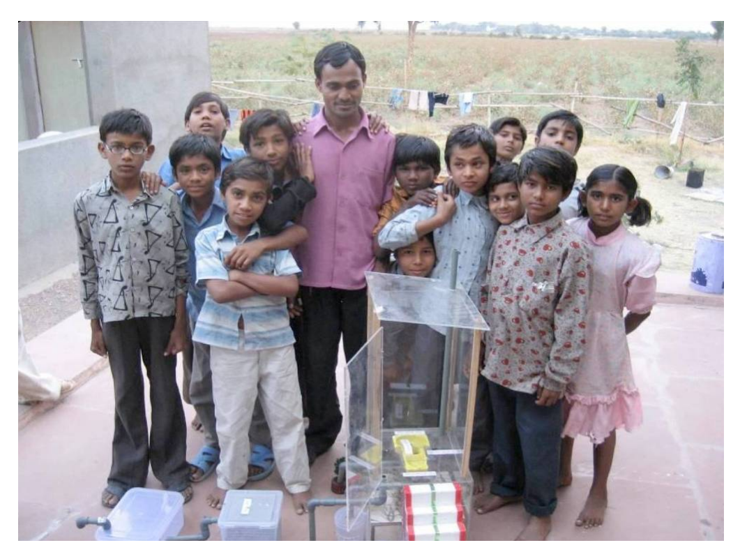
Figure 6: Proud of their ecosan sanitation system – Pupils of the Navsarjan school near Ahmedabad (Gujarat, India).

The present publication constitutes a means of providing some insight into Indo-German development cooperation by highlighting implemented projects for innovative sustainable sanitation systems which are the base for knowledge-management, networking and the development of an enabling context for sustainable sanitation solutions.