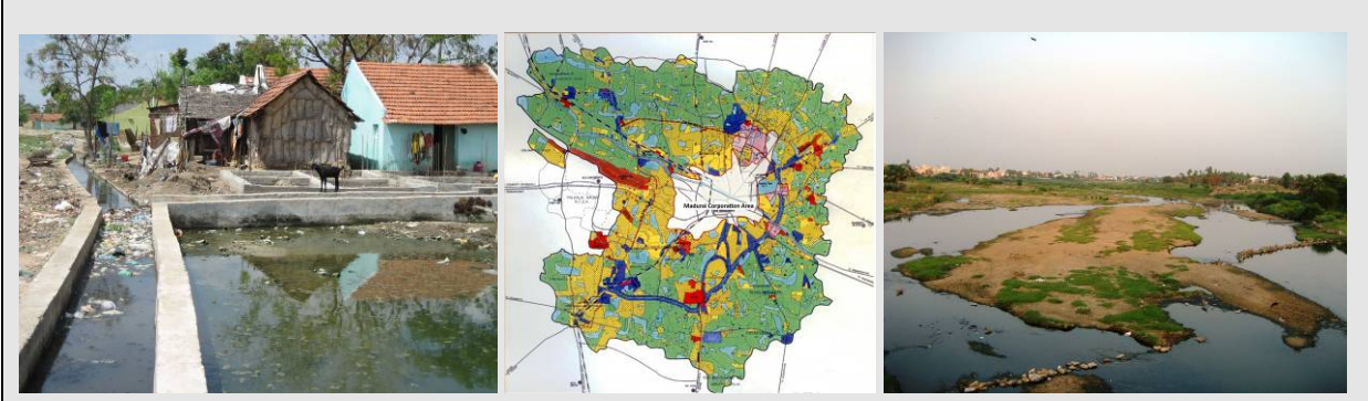
Figure 13: Rainwater drains used for blackwater disposal (I), Madurai Urban Agglomeration with Municipal Corporation limits (m), Vaigai River (r)

Madurai Municipal Corporation is aware of the shortcomings and is working on modernising and augmenting the existing drainage system and providing adequate centralised treatment. However, planned and already started improvements do not solve Madurai's sanitation problem entirely. Although the scheme aims towards universal ward coverage with underground drainage within Corporation areas, it is not scheduled to cover the complete population. Another shortcoming for Madurai as an urban agglomeration is, that scheduled improvements are restricted to Municipal Corporation areas. Urban settlements located outside Corporation limits are omitted.