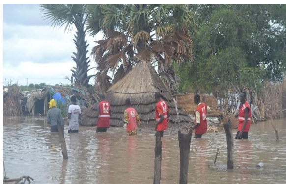
Figure 2: South Sudan Red Cross's team are carrying out emergency response activities in floods affected areas.

In South Sudan, over 600,000 people were displaced by floods according to the United Nations (UN). Flooding along the White Nile has affected four counties in six states since July 2020. Heavy rains have caused rivers to overflow their dykes and banks, flooding in vast areas and settlements along the White Nile in the center of the country, with the states of Jonglei and Lakes being the worst affected. According to a Rapid Needs Assessment, priorities include water, purification tablets, plastic sheeting for temporary shelter, mosquito nets, fishing kits, and medicines for Malaria, Diarrhea and other waterborne diseases