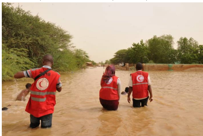
Figure 1: The Sudanese Red Crescent's volunteers in frontline floods assessments and response activities

In Sudan, 17 of the country's 18 states have been affected, with North Darfur, Sennar, West Ordofan, and Kassala being the worst affected. More than 0.5 million people have been affected and 99 people have lost their lives and over 100,000 houses have been damaged. Thirty-four (34) schools and 2,671 health facilities have also been damaged. It has also been stated that the magnitude of rain and floods this year exceeds the 1988 and 1946 floods. The affected families are seeking shelter with relatives and host communities. Following a meeting with the Council of Ministers, the Security and Defence Council in Sudan has declared a state of emergency for three months in the whole country and formation of a higher committee to mitigate the effects of the floods