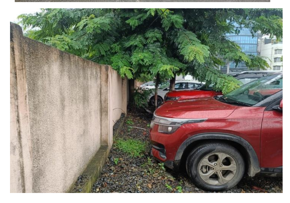
Page 13 of 30