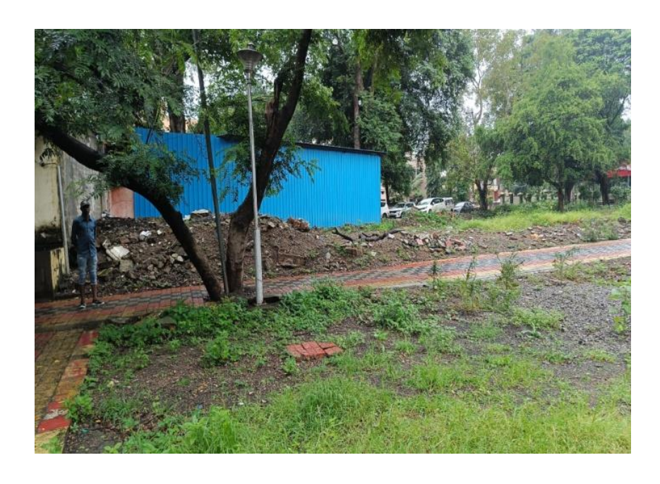
Page 10 of 30