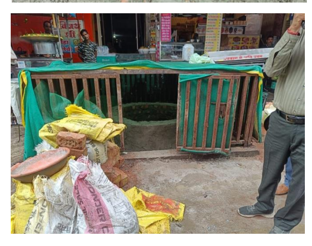
Page 7 of 30