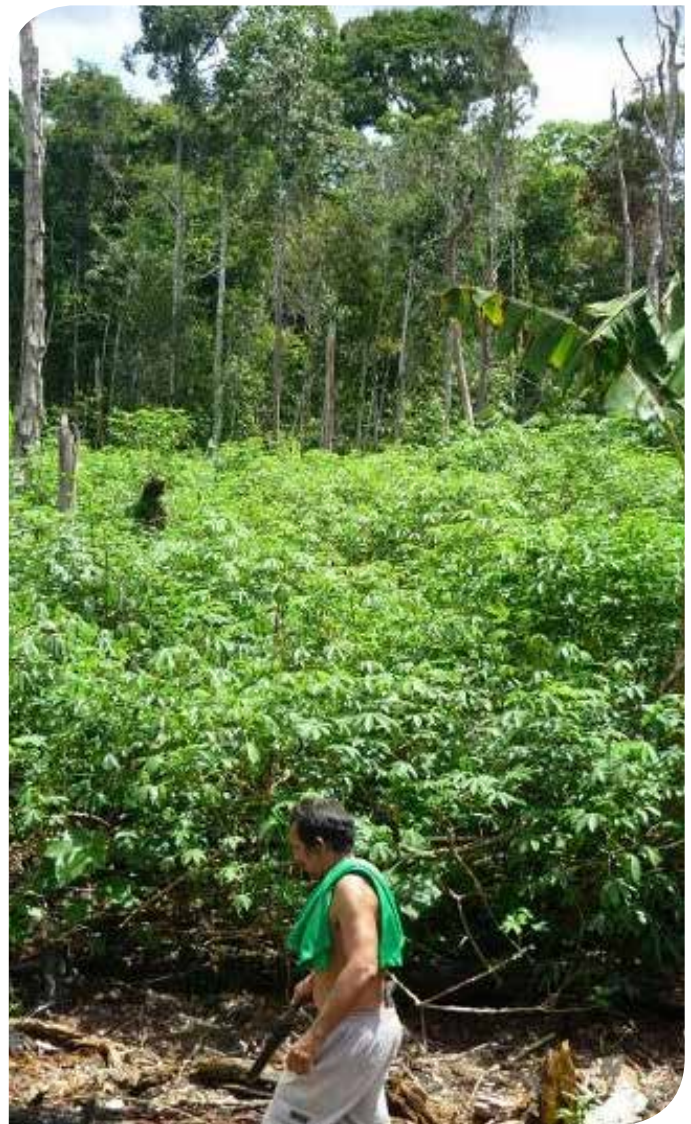
Image: Roza. Shifting cultivation of cassava in the Amazon rainforest in Brazil. Image: CENSAT - Friends of the Earth Colombia