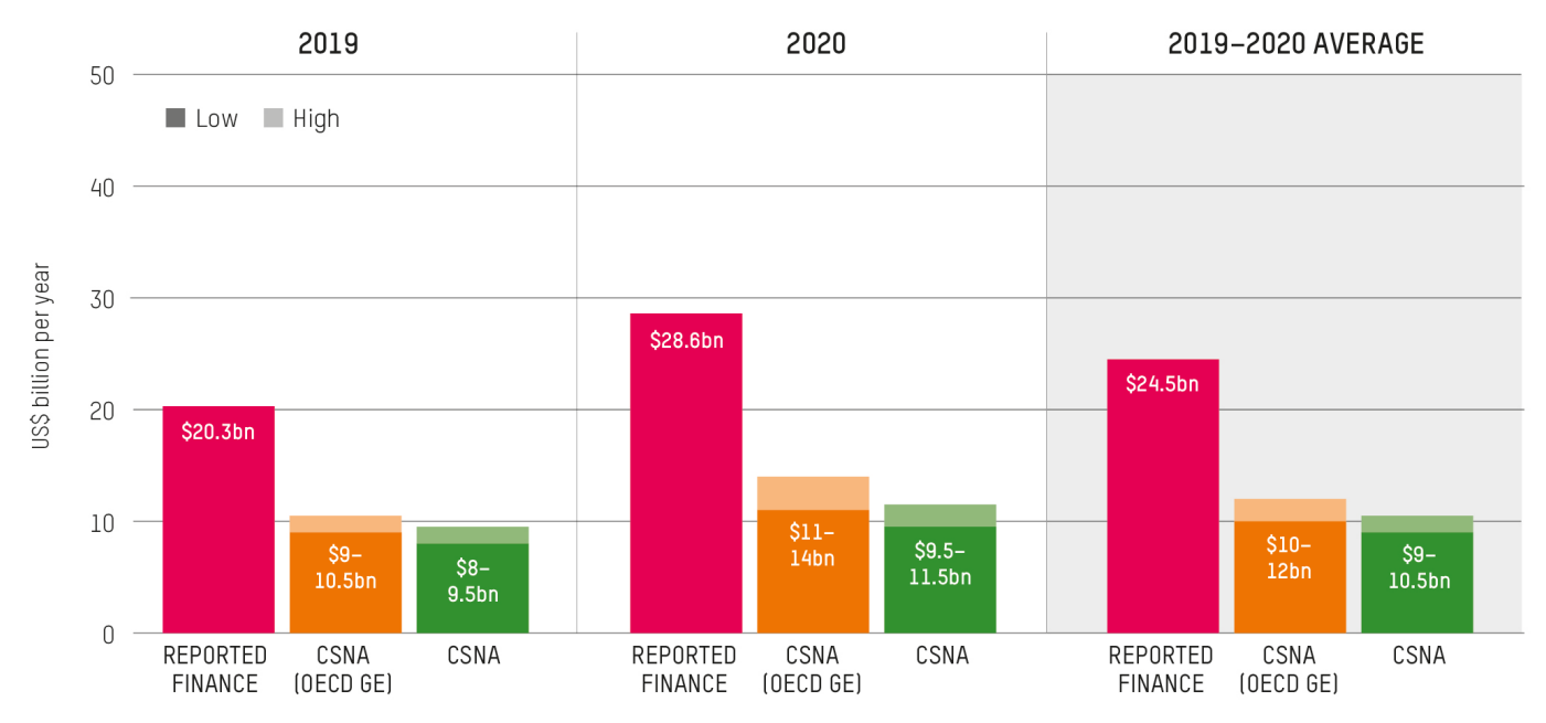
Figure 2: Reported adaptation finance versus Oxfam's estimates of adaptation-only climate-specific net assistance (2019, 2020 and 2019–20 average)

Note: The red bars show reported adaptation finance as compiled by the OECD (OECD 2022a). The orange bars show Oxfam's estimate of climate-specific net assistance for adaptation finance based on OECD grant equivalent accounting. The green bars show Oxfam's estimate of climate-specific net assistance for adaptation using a more robust methodology to estimate grant equivalence. All figures show adaptation-only finance, not including 50% of cross-cutting finance. The orange and green bars show figures rounded to the nearest 0.5. See T. Carty and J. Kowalzig (2022) in bibliography for detailed methodology.