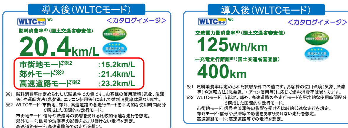
Figure 2. Fuel economy requirements under 2030 standards in Japan. The left label is for conventional vehicles and the right label is for BEVs.