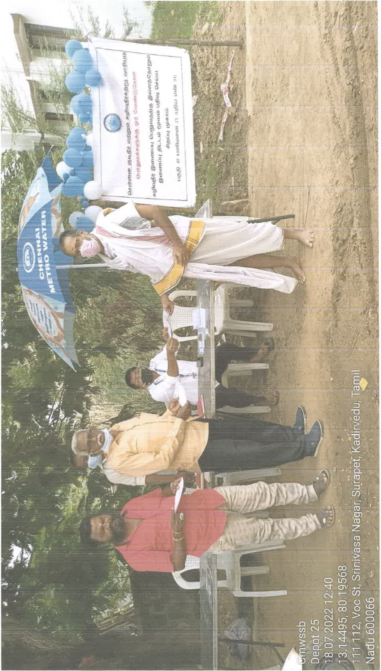
Gmwssb Depot 25 18.07.2022 12:40 13.14495, 80.19568 111 112, Voc St, Srinivasa Nagar, Surapet, Kadirvedu, Tamil Nadu 600066