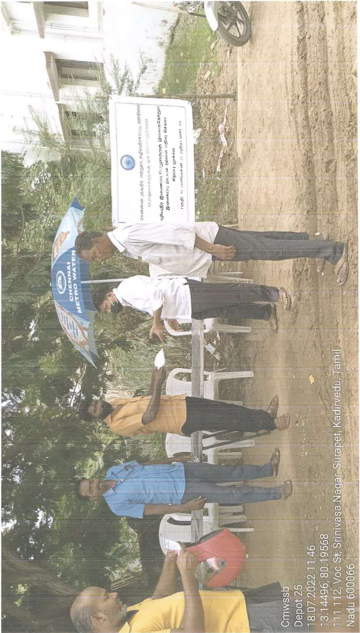
Cmwssb Depot 25 18.07.2022 11:46 13.14496, 80.19568 111 112, Voc St, Srinivasa Nagar, Surapet, Kadirvedu, Tamil Nadu 600066