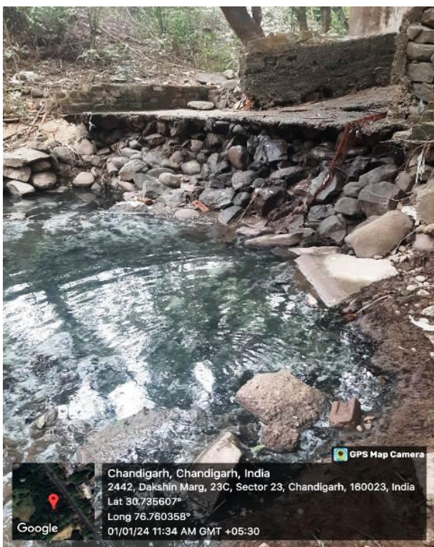
Sector 36, Hibiscus Garden