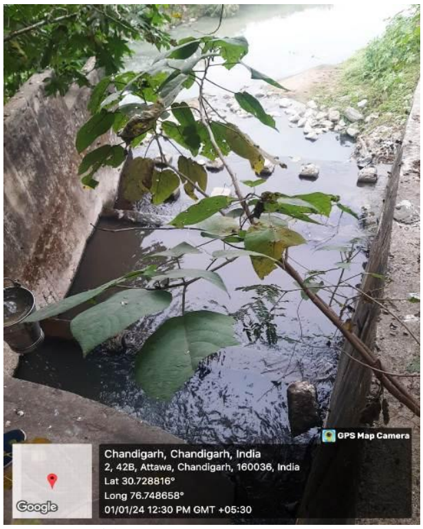
Inside Sector 42 Sports Complex