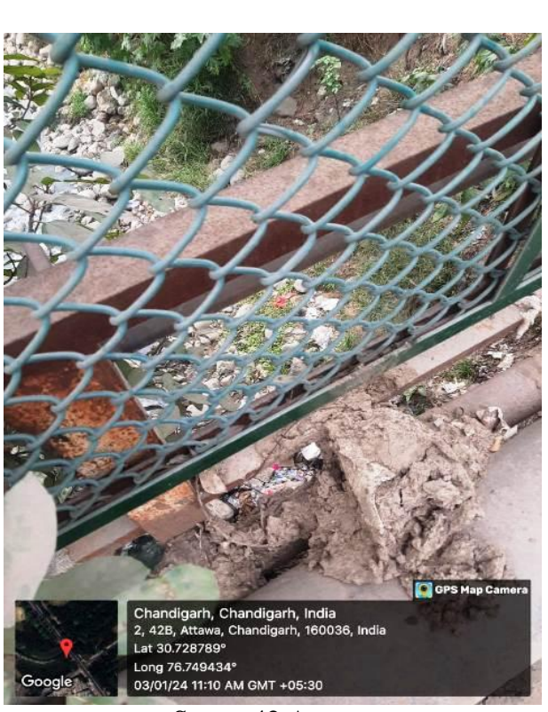
Sector 42 Attawa