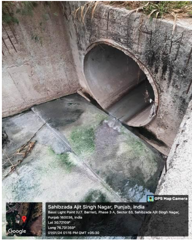
W/w from Punjab Area (inside Garden of Spring)