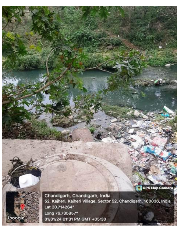
W/w adjacent to Kajheri water distribution unit