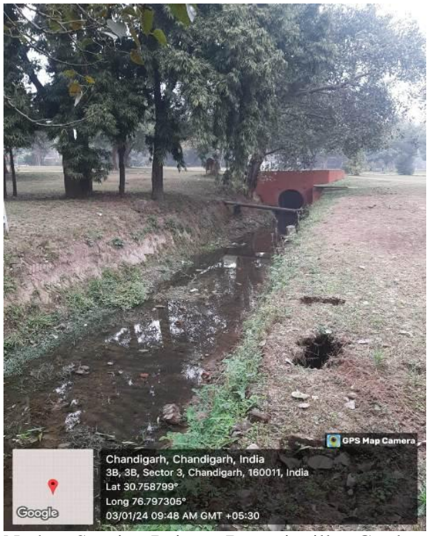
N-choe Starting Point at Bougainvillea Garden