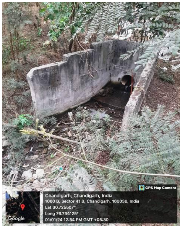
Backside of Furniture market Sector 53