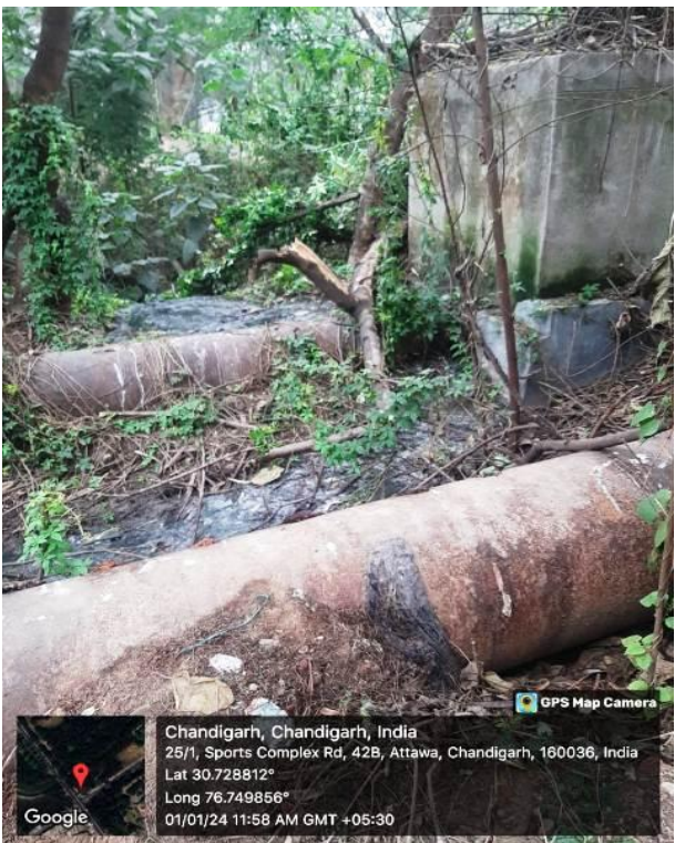
End Point of Sector 36