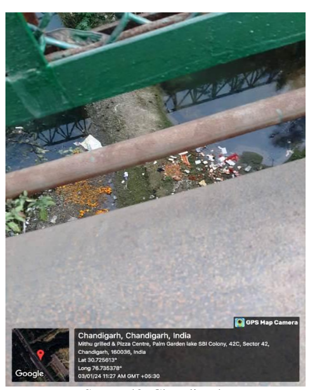
Sector 42, Chandigarh