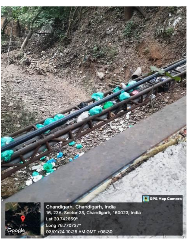
Sector 23, Chd.