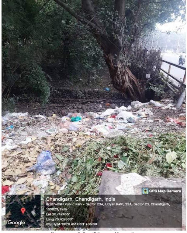
Sector 23, Chandigarh