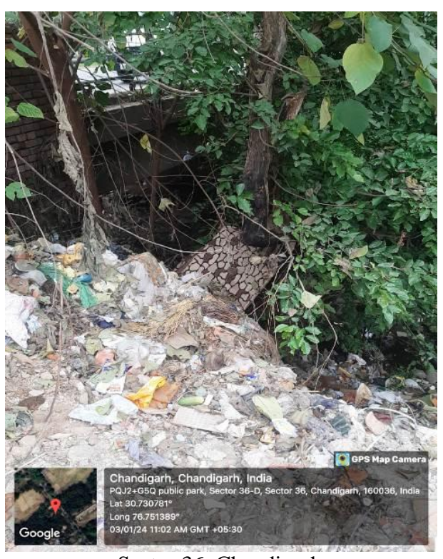
Sector 36, Chandigarh