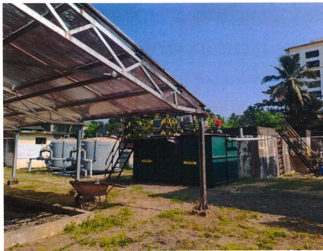
Fig.10 CSTP GCDA, Kalloor

The Committee members visited the GCDA plant at Kalloor. It is a 750 KLD plant of which only they are getting 30KLD. As they were taking waste water from hotels, high content of oil, maida created problems to their plant and is being rectified. Kochi Corporation officials and GCDA were asked to take action for the complete utilization of CSTP. The Additional Secretary, Kochi Corporation was asked to explore the possibility of full utilisation of CSTP by bringing waste water from nearby flats and hotels. Additional Secretary, Kochi Corporation informed that byelaw for registration of tankers and online tracking will be placed in the Council meeting on 28 th February, 2023 and after that action will be taken for registering tankers.