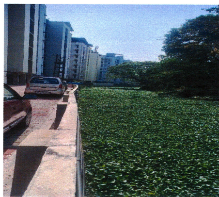
Fig. 9 Apartment near Edappally canal