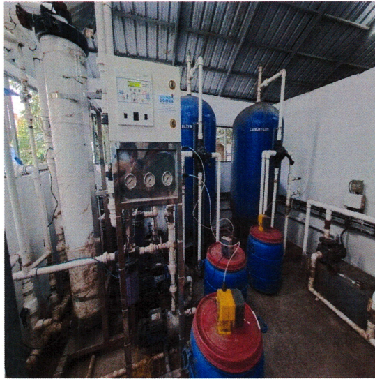
Fig.13 Common STP for houseboats at Kumarakom