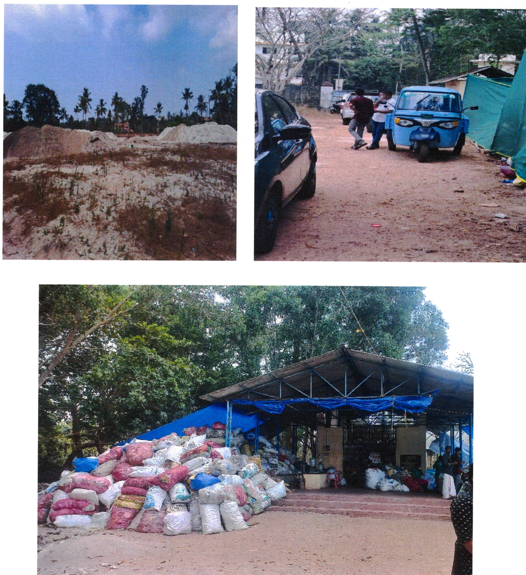
Fig. 5 Cherthala Municipality FSTP, MCF, e-auto

Municipality is seen provided near the site and electric auto was also seen provided for the conveyance of plastic waste.