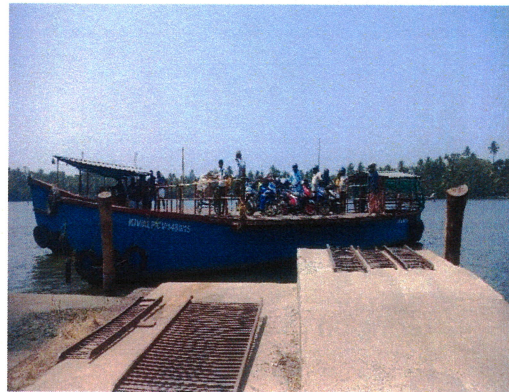
Fig.8 Vembanad lake-Keltron kadavu