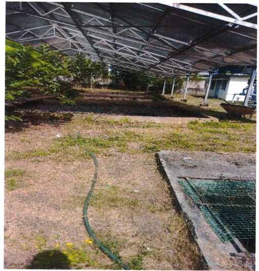
Fig. 11 CSTP of KWA, Elamkulam