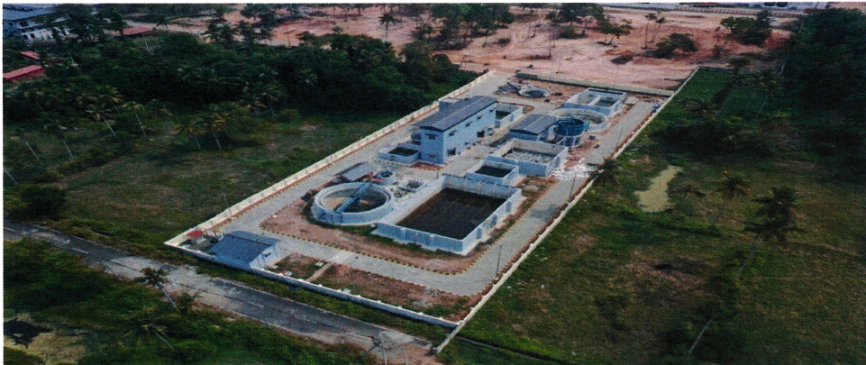
Fig.6 CETP Mega food park, Aroor