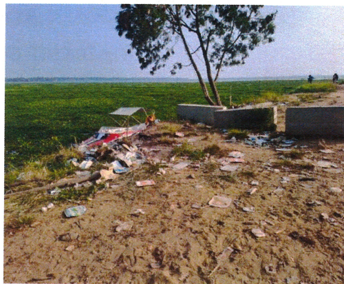
Fig.12 Thanneermukkom barrage