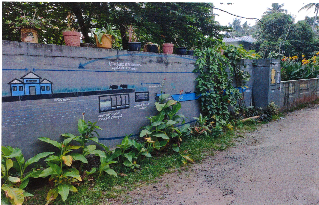
Fig.2 DEWATS, Chathanad, Alapuzha

DEWATS system provided at Chathanad was visited. It is a decentralised waste water treatment system provided for a slum area with fifty houses. It consists of Anaerobic Baffle Reactor and constructed wetland and the maintenance cost is very low for such system. This system is operating for more than three years continuously. Health official of Alappuzha Municipality informed that they are providing such system at Alissery slum and Zakariah Bazar.