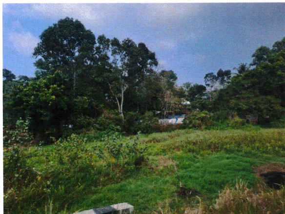
Fig.4 Alappuzha-Cherthala Canal

Alappuzha Cherthala Canal was seen covered with vegetation and there was no flow of water in this canal.