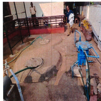
Fig. 1 Houseboat landing area, Pallathuruthy, Alappuzha