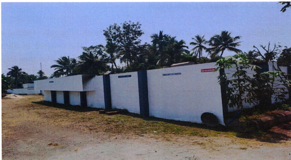
Fig.8 Sea food factory-CETP, Aroor

The committee members visited the CETP of sea food factory at Keltron Kadavu. It is also working underutilized.