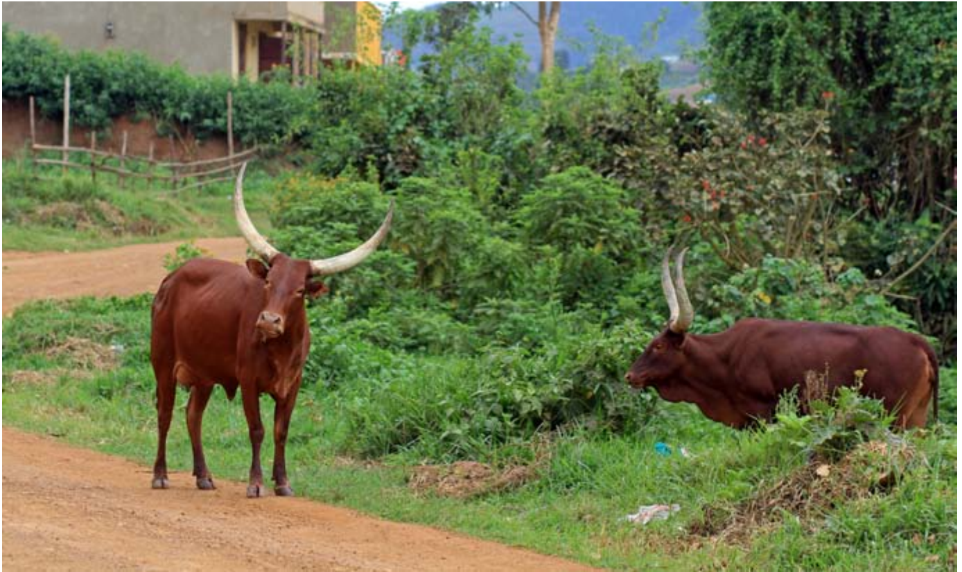
Traditional cows grazing on the side of the road in Rwanda. Two hundred million herders in the world graze their animals in areas where crops often cannot be grown.

of “emissions intensity”, in which GHG emissions are examined per unit of output (per kg of meat, litre of milk or unit of protein). Measured this way, animals that are intensively raised for maximum output of meat and milk—by a few million farmers mostly in the US, Europe, Brazil, New Zealand and a few other rich countries—have a lower “emissions intensity” than the animals of poor farmers, which are raised for many more uses and without access to the high protein feed, antibiotics, growth promoters and hormones used by intensive livestock industries. Poor farmers are thus said to suffer from an “emissions intensity gap” and should be pushed into what is termed “sustainable intensification” or, more broadly, “climate smart agriculture”. 28