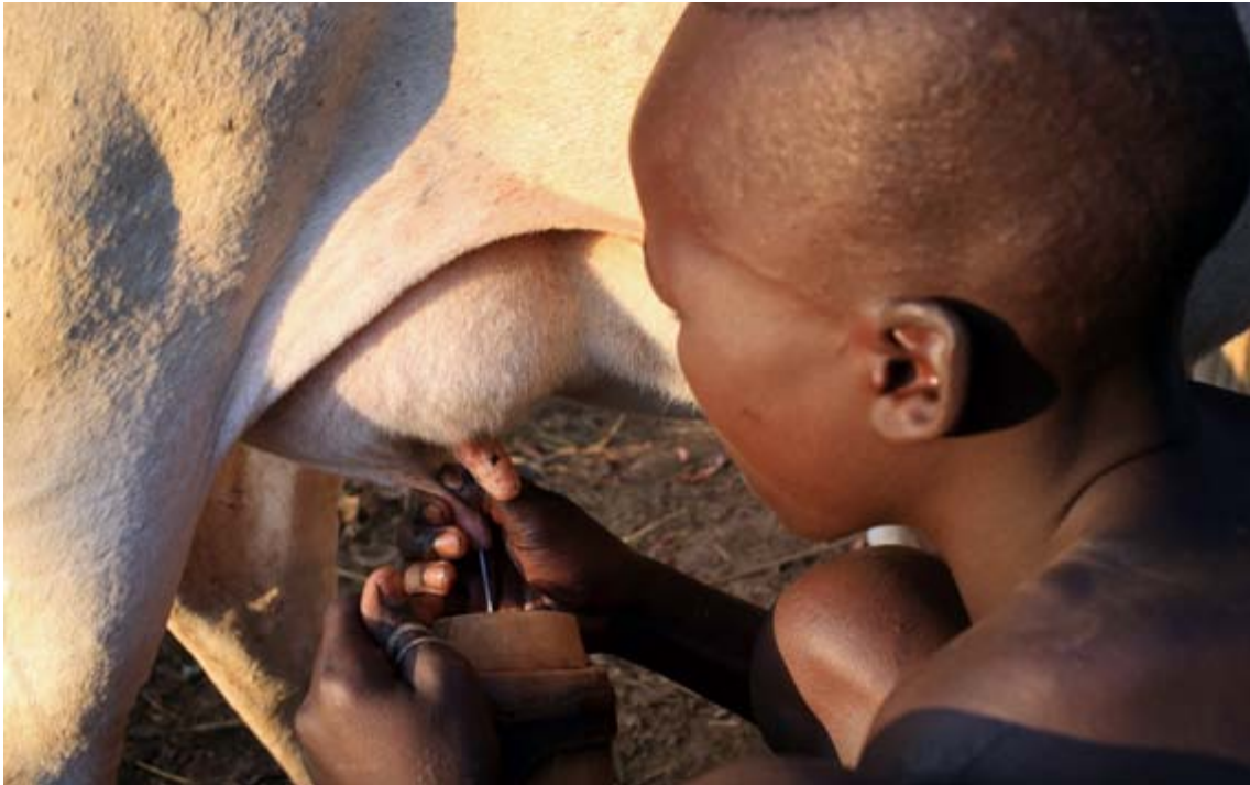
A herder boy milks a cow in Ethiopia. Pastoralists contribute little to climate change and their animals provide many uses and benefits.