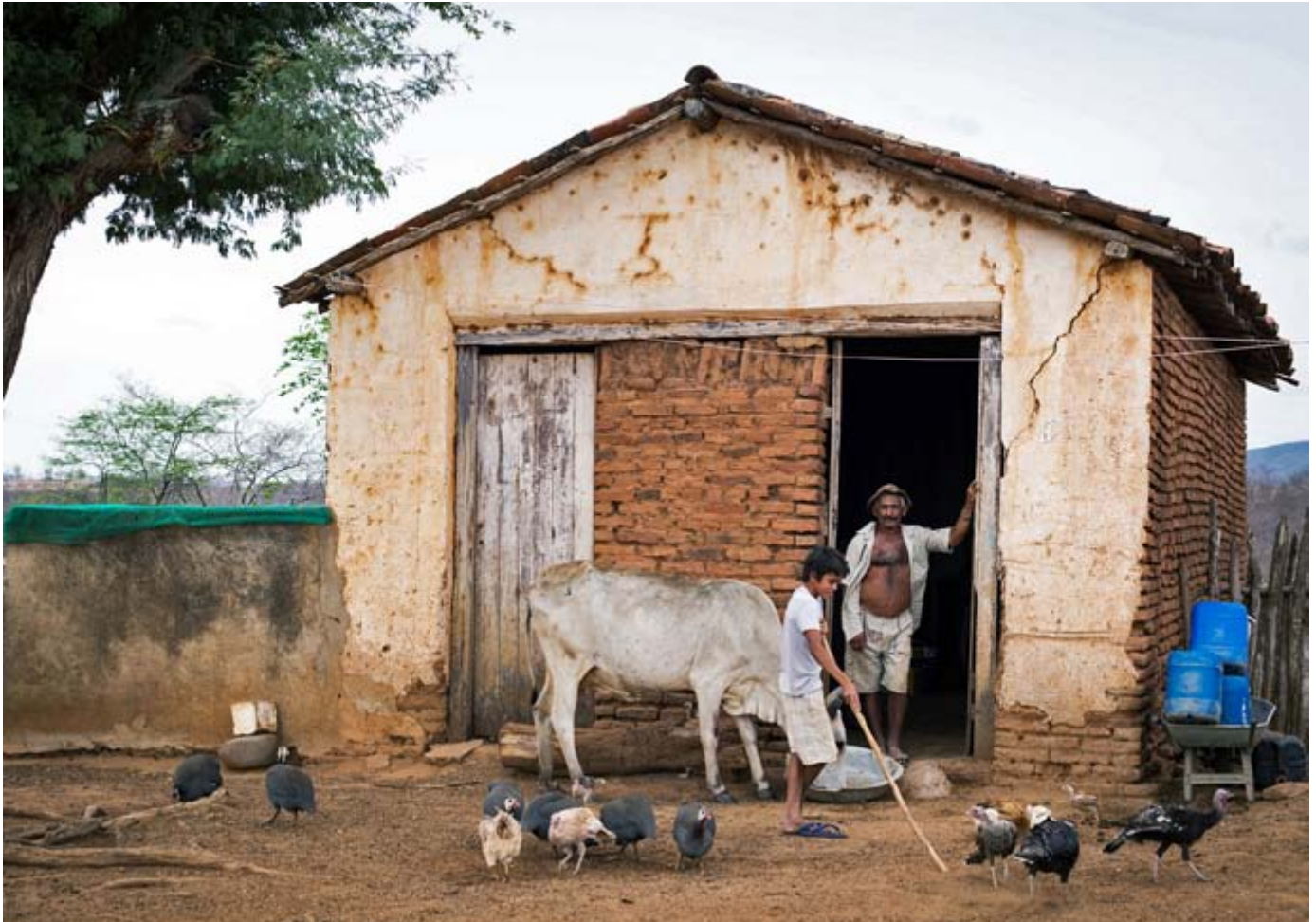
Small farm with animals in Ceará, Brazil. Small-scale livestock production enhances family nutrition and food security.

These accords artificially prop up production and consumption by promoting the dumping of cheap meat and dairy into poor countries' economies. This is not only killing local livelihoods, it is also killing our climate. We need to recognise this and redirect both investment and policy support to local, national and regional markets for sustainably produced livestock.