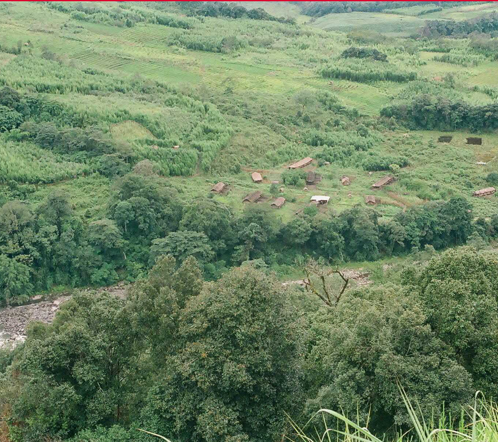
Image- Forests from Upper Dibang Valley, Arunachal Pradesh.