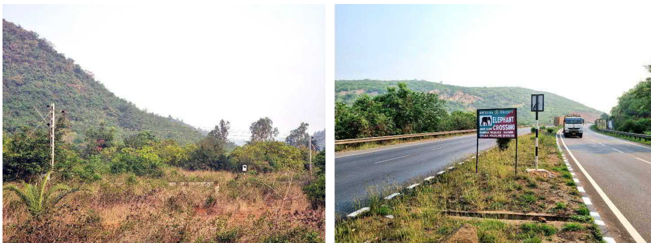
Photo 3. A railway line and road running parallel to each other fragmenting a forest land in Ganjam, Odisha. In 2012, a herd of 6 elephants including 2 calves were killed by speeding train in this area.

India has a 63,31,791 km. of road network across the country, wherein almost 60,20,000 km. are not categorised as National Highways or State Highways. 20 These are mainly district roads, and village Roads 'maintained by the government'. Similarly, as of 2020, the route length of Indian railways is roughly 68,000 kms. 21 Forest land along such vast network will be excluded from the purview of the FCA for providing access to habitation and amenities.