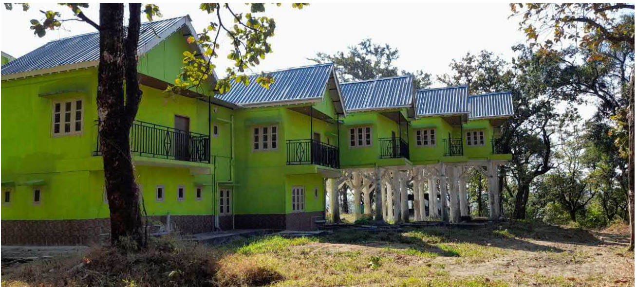
Photo 5. A Tourist Rest House constructed inside core area of Manas Tiger Reserve, Assam

Several activities relating to or ancillary to conservation, development and management of forests and wildlife are exempted from the requirement of permission under Section 2 of the FCA. Such activities must be undertaken when necessary and after exploring all suitable alternatives. It must be ensured that such infrastructure does not cause any disturbance to wildlife and their movement. The purpose for all such establishments must be to protect and conserve the forests and wildlife, and not for any leisure or commercial purposes. Thus, it is essential that sufficient reasoning is provided for such developments as a necessity for forests and wildlife conservation. Under the provision on exemption of works 'ancillary to conservation', the Act must also specify the Certified Authority which would decide whether the work falls under the category of ancillary or related work. It is suggested that the Certified Authority with respect to conservation of wildlife should be the Chief Wildlife Warden or Principal Chief Conservator of Forest ("PCCF") with respect to forest conservation.