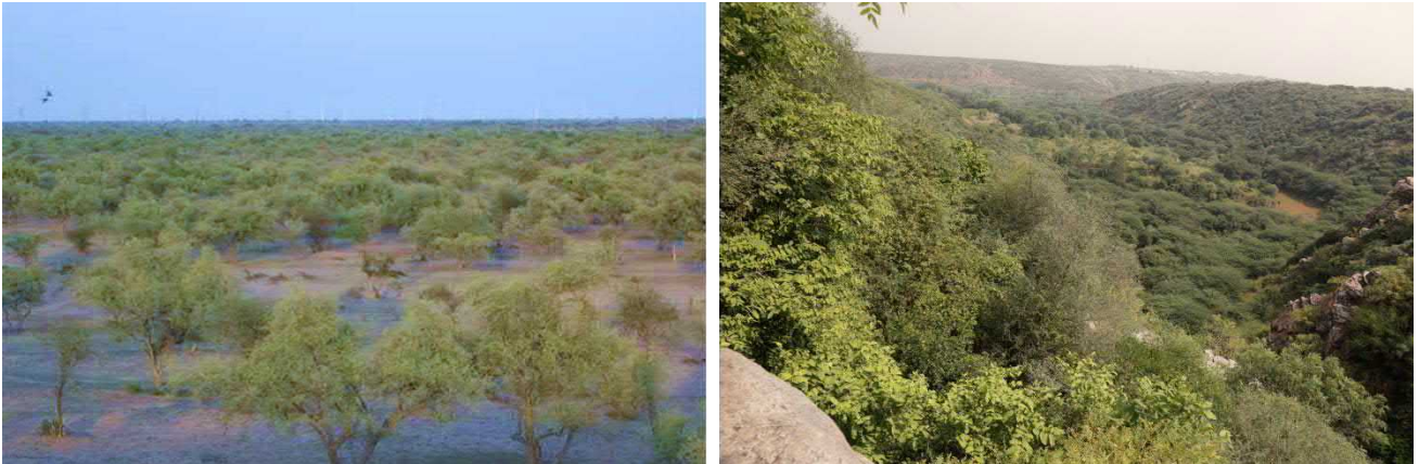
Photo 1. Left: Orans in Jaisalmer, Rajasthan; Right: Forests of Mangar in Gurugram. Both these landscapes are yet to receive legal status of a 'forest'

States have failed to recognize them as forests. Such forests are not only biodiversity-rich and important wildlife habitats but are of immense national importance for the ecological services and carbon sequestration benefits they provide.