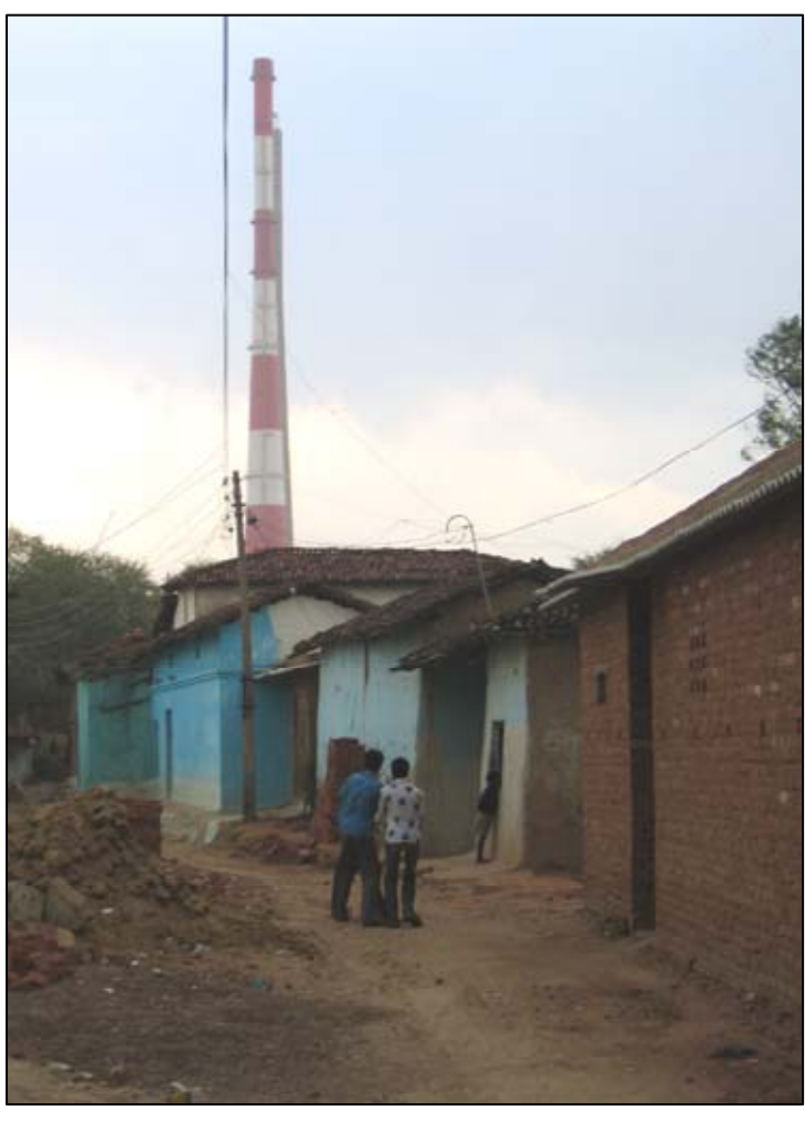
The twin chimneys of the Lanco plant tower over nearby Khoddle

Driving down the road towards Patadi the two chimneys of the Lanco Amarkantak Thermal Power Plant become visible from several kilometres away. They dominate the skyline, towering 220 metres over a flat landscape; one painted in the red and white of warning, the other a more sombre shade of grey. Large trucks rumble past, ferrying materials to the 500-acre construction site where cranes and scaffolding cluster around the steel skeletons of buildings. This was once the land of farmers from the surrounding villages of Patadi, Saragbundia, Khoddle and Pahanda. These 'affected villages' are listed on a sign that stands next to the road, along with the company's fire logo and the slogan 'Lanco: Inspiring Growth'. Another sign, in front of the perimeter fence, states simply in foot-high letters: 'Prohibited Area'. On a grassy verge beside the main road, flowers spell out the name 'Lanco Amarkantak', with unintended irony: 'Amarkantak' is the name of a place in Chhattisgarh renowned for its beauty.