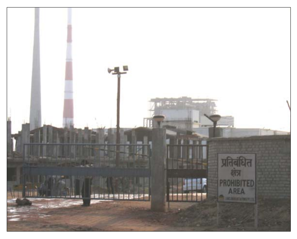
'Prohibited Area' reads the sign at the entrance to the Lanco construction site

MW, it plans a 22-fold expansion in its energy portfolio to more than 11,000 MW by 2013. For the year ending March 31 2007, LITL had a total income of Rs 16,473 (about $412 million) and an annual profit of Rs 1,879 (about $47 million), representing an 11-fold increase on the year before. These results make it one of the fastest growing companies in India.