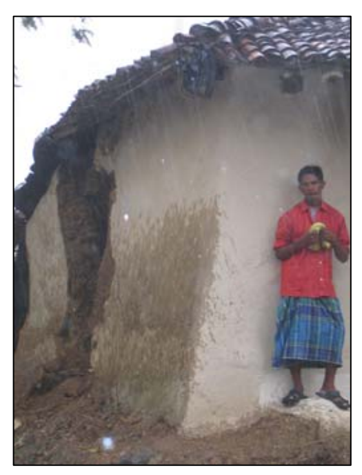
Villagers in Khoddle say that these cracks have been caused by blasting in the project site. Lanco says that the cracks are minor and may have been caused by other factors; no compensation has been provided.