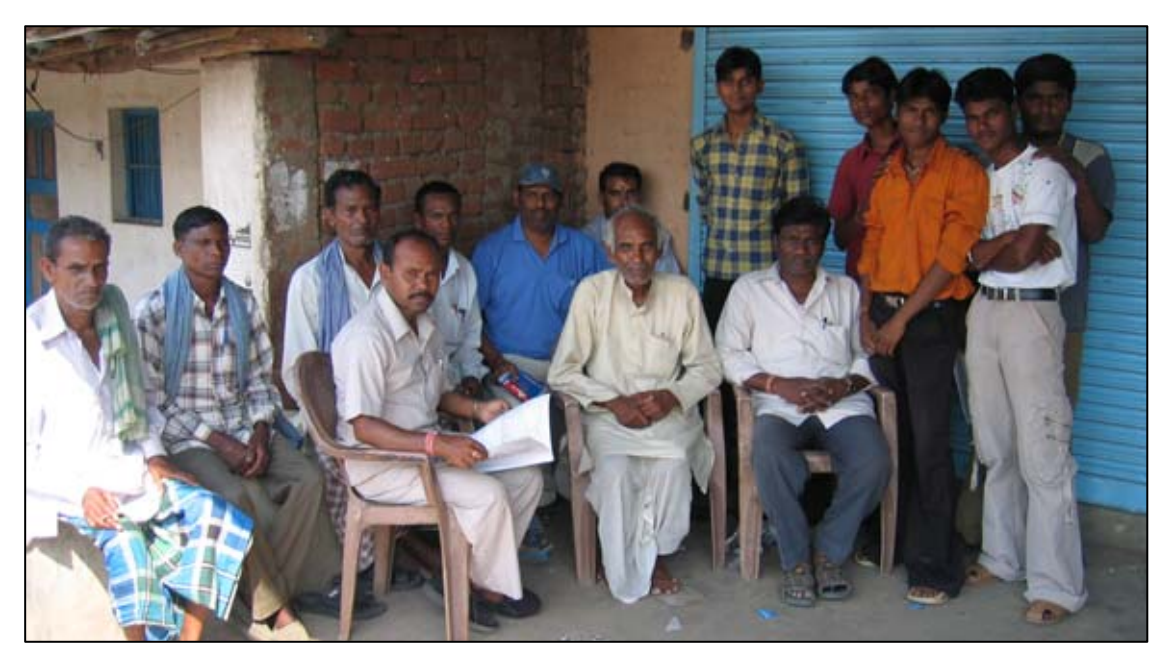
Villagers in Saragbundia

ceremonies has been acquired; one man sardonically remarked that cremation would now have to take place in the furnaces of Lanco. As one local activist points out: 'We have not a single piece of land left for community development. All land has been acquired by the company'.