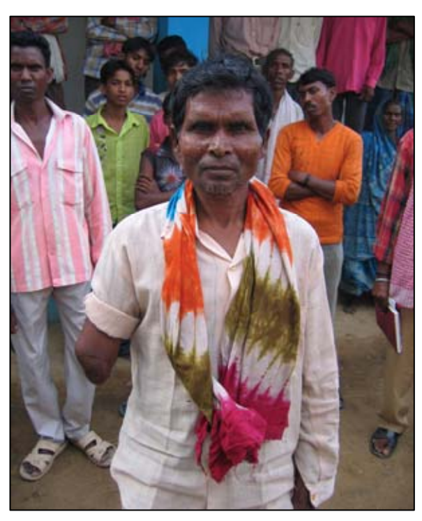
This man lost an arm on the construction site. He has yet to receive compensation, but it has now been promised for a future date.

Union officials also raised serious concerns about working conditions on the construction site which raise questions over complaince with IFC Peformance Standard 2 (Labour and Working Conditions). They say that water and sanitation facilities are inadequate and health and safety standards are low. There have been several deaths, they claim, as a result of people falling from scaffolding. Lanco officials would only confirm that one man had died and another had lost an arm in an accident; in cases, they say, full safety precautions were in place and an inquiry and compensation were provided in the proper manner. Interviewed for this study, the man who had lost an arm - a resident of Pahanda village - said that he had so far received no compensation for his injury. A hearing for this matter was conducted on 28 March by the Assistant Labour Commissioner for Korba; due compensation will reportedly be awarded at a future date. In addition, a report in a local newspaper describes the death of a